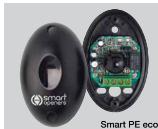
Smart PE eco

The Smart PE Beams provide an additional level of safety to your door via an invisible beam across your driveway. Once this beam is breached, the door will reverse, therefore avoiding or reducing any contact with the object beneath. Not only a Smart decision to install one, but Smart safety for your home.